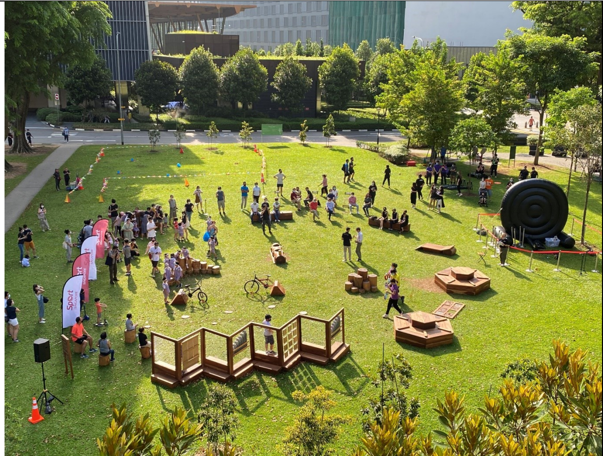
View of the eco-playground at the DTP Community Green