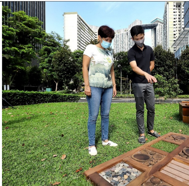
Minister Indranee Rajah stopping by the Sensory Path